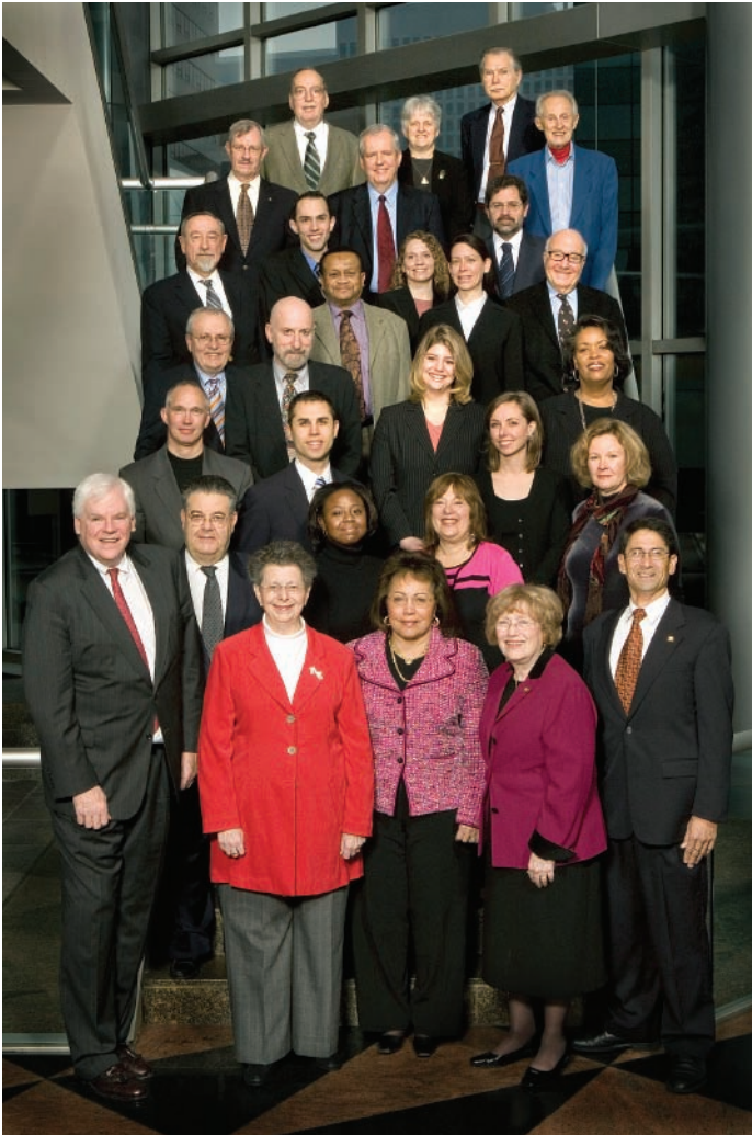
The APA 2007-2008 Board of Trustees

The APA was fiscally strong in 2007. Financial strength enhances the organization's ability to serve members, patients and the medical and mental health communities.